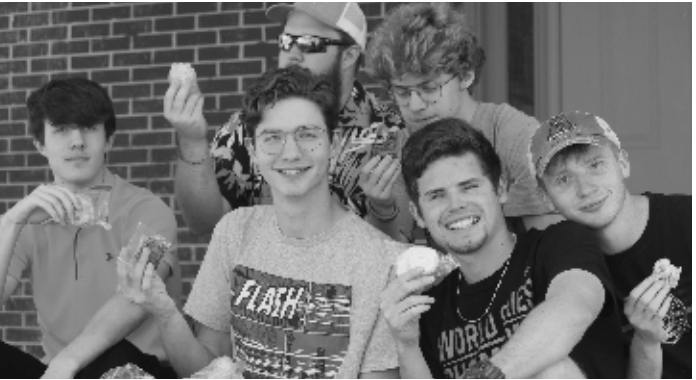
BCF Students enjoy cookies on "Cookie Day" - a special time of the year when First Lady, Ruth Kinchen, prepares cookies for students