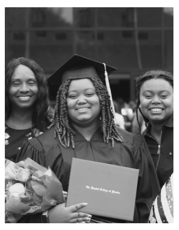
Newly graduated, this BCF alumna poses with her family for a picture

A course designed to assist the student in becoming effective in planning, organizing, building and growing a music and worship ministry. Subjects discussed will include long-range planning, organization, calendaring, budgeting, maintenance of resources such as libraries, instruments and equipment, and coordinating with other ministries of the church. Three semester hours credit.