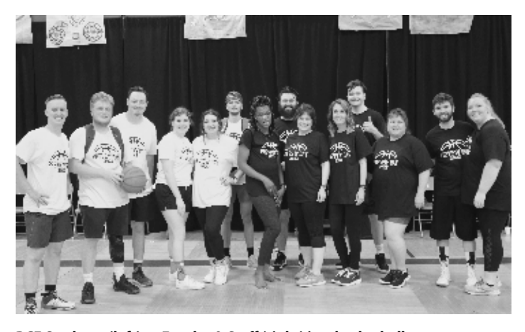
BCF Students (left) vs Faculty & Staff (right) in a basketball game on Preview Day