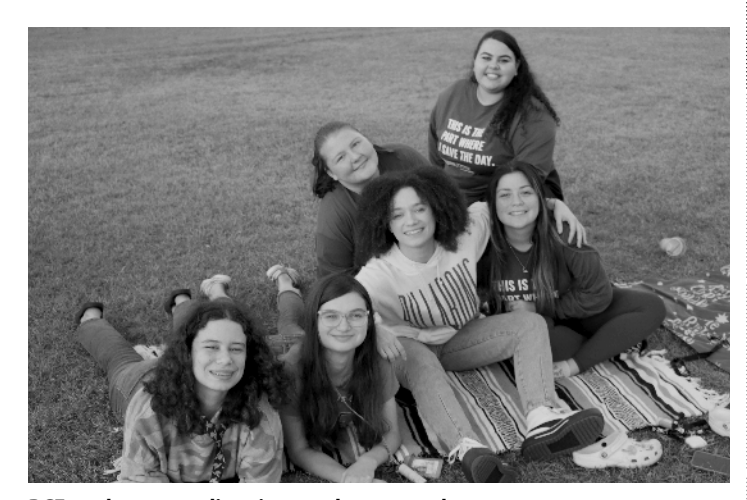
BCF students spending time on the campus lawn