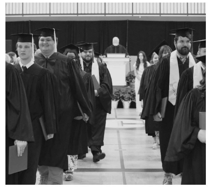
BCF graduates exit the Wellness Center following their ceremony

Participation in New Student Orientation is required of all students who are beginning their first semester at The Baptist College of Florida. New Student Orientation provides essential information about college policies, campus facilities, and college life. Sessions include special times of fellowship and recreation with other students, faculty, and staff members. Attendance is mandatory. Orientation for online students is provided through email messages and links and IT 110 N. Orientation to Online Learning.