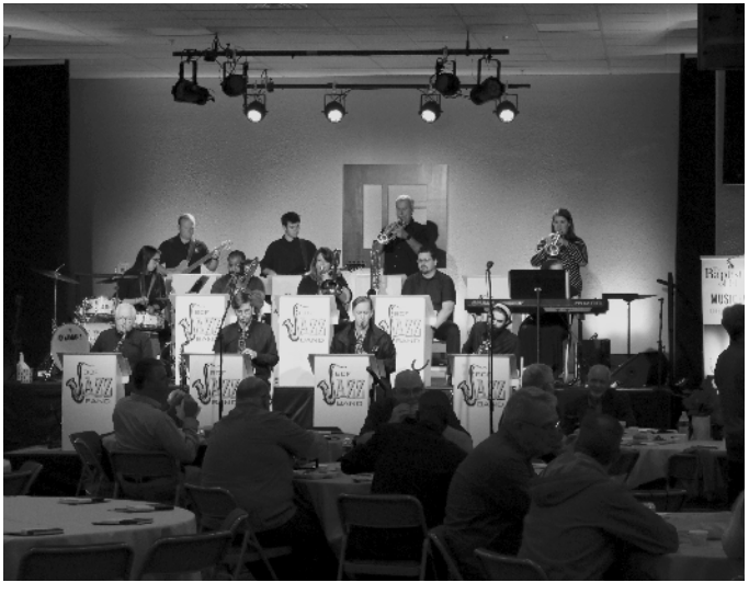
BCF Jazz Band performance