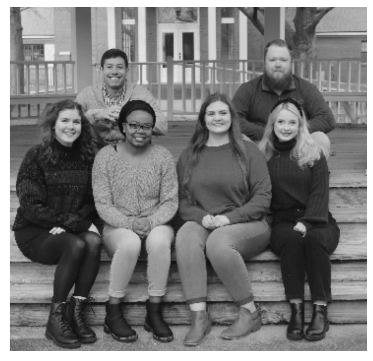
A group of BCF students sit on the steps of the Daniel Plaza gazebo