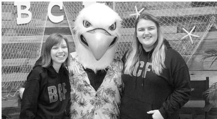
Students pose with Izzy at the Grand Opening of "Izzy's Isle"

NOTE: FOR INFORMATION ABOUT STUDENT HOUSING, SEE THE STUDENT LIFE SECTION OF THIS CATALOG.