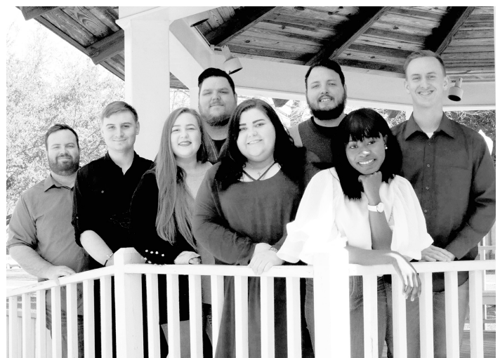
Student music group “One Voice”