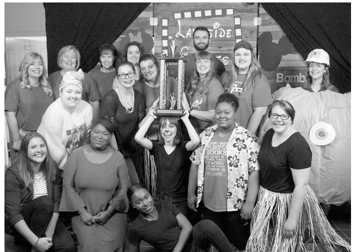
BCF students celebrating their victory at BCM Lakeside Echo