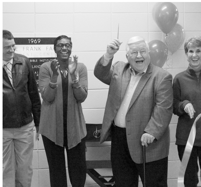
Ribbon cutting ceremony for Izzy's Isle