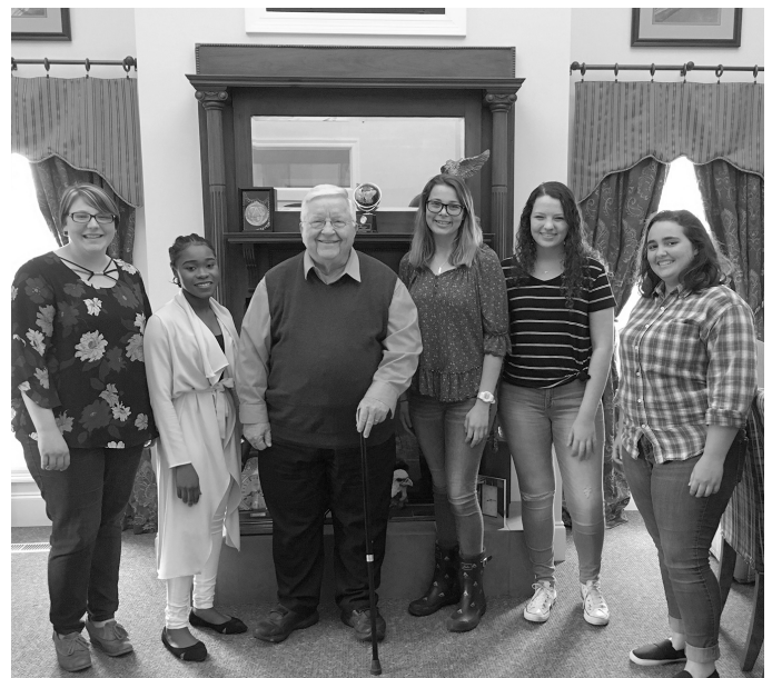
BCF students receiving Scholars in Residence Scholarship

*EDU 2000 and EDU 4090F students may need to begin their work prior to the scheduled beginning of the semester.