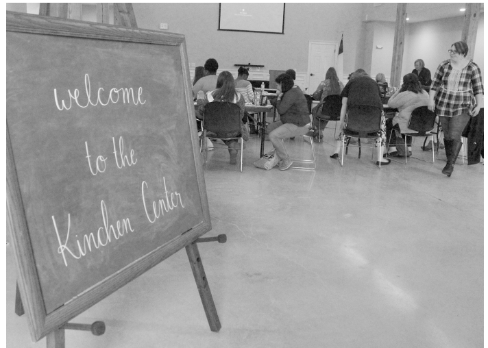
“Welcome to the Kinchen Center”