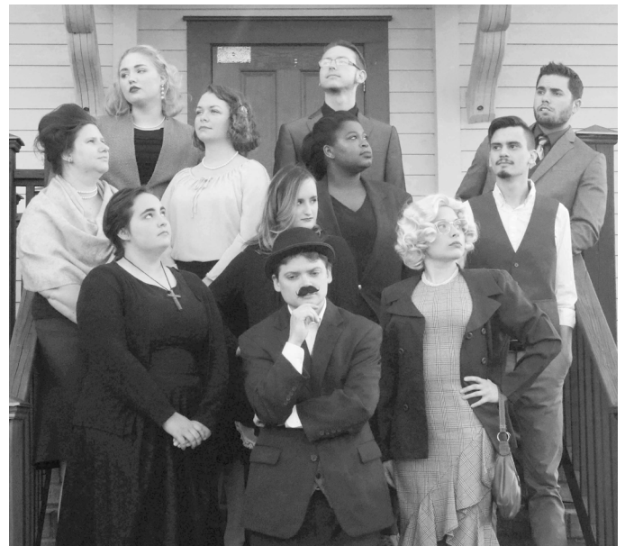
The cast of the English Department's play, "Murder on the Orient Express"