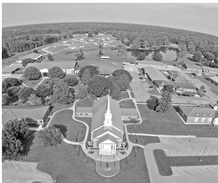
Aerial image of the R.G. Lee Chapel (2018)

be a spring semester charge) may be paid when you complete registration at the Office of Business Affairs.