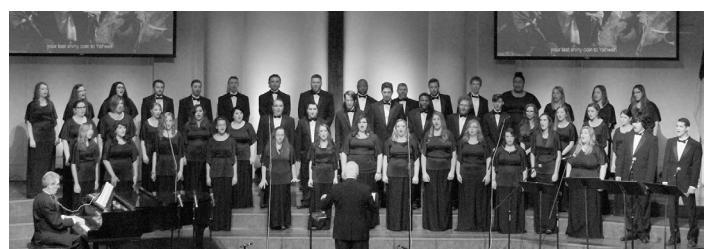
BCF College Choir

FYI 101. Student Success Course .....3 SEM/HOURS