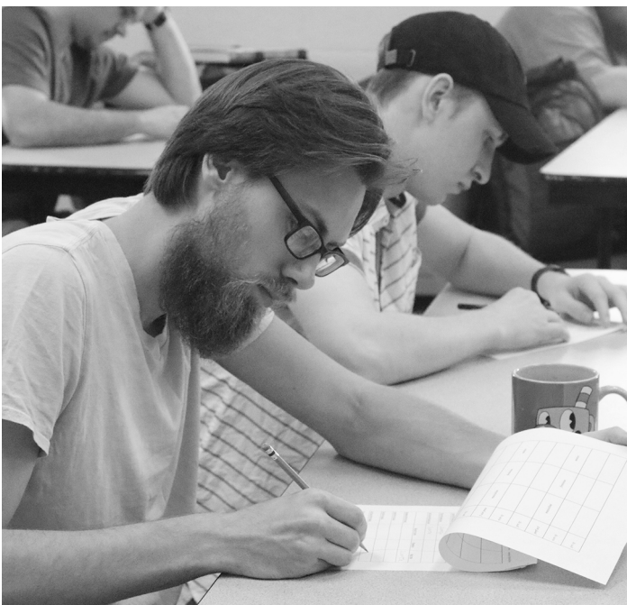
BCF students hard at work in Solomon Hall

The following numerical and letter grading system is employed by the faculty in assessing each student's performance.