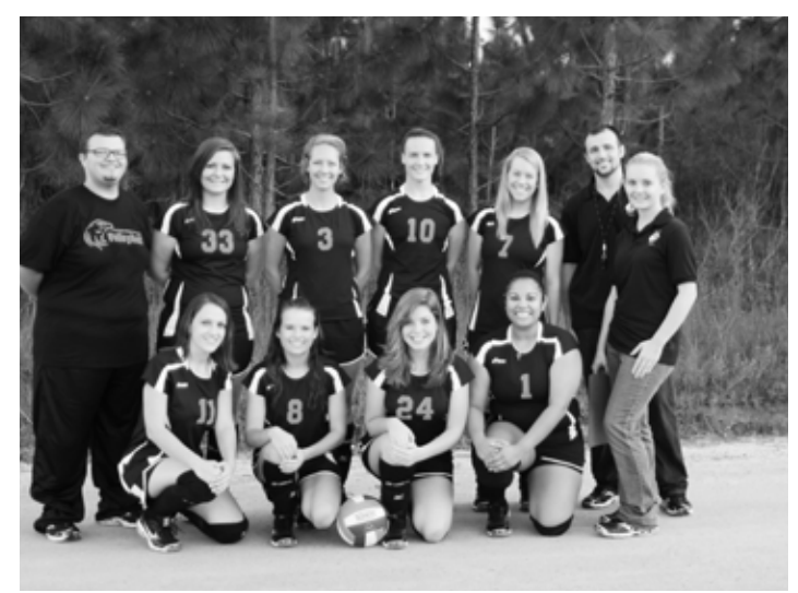
BCF Lady Eagle's Volleyball Team

A research of contemporary literature produced by Southern Baptist missions agencies as well as other denominations to discover strategies on the cutting edge of missions advance. Prerequisite: Junior standing. Three semester hours credit.