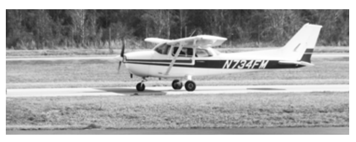
Plane used for the BCF Aviation Program