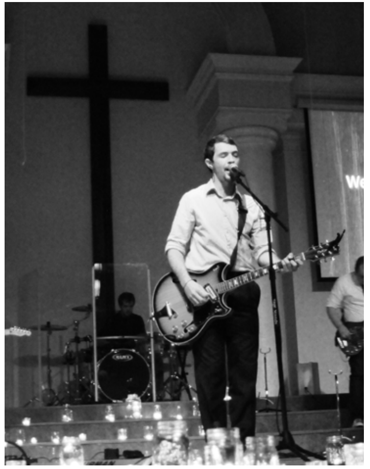
Student led Worship in R.G. Lee Chapel

A course designed to assist the student in becoming effective in planning, organizing, building and growing a music and worship ministry. Subjects discussed will include long-range planning, organization, calendaring, budgeting, maintenance of resources such as libraries, instruments and equipment, and coordinating with other ministries of the church. Three semester hours credit.